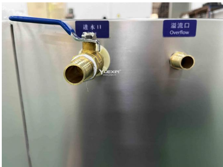
Water Inlet and overflow