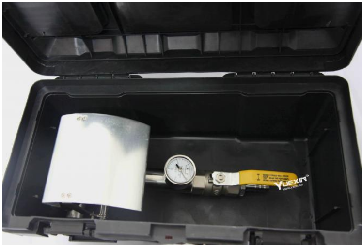
the appearance of shower head

Product Name: IPX3-4 Rain Spray Test Equipment IP Rating: IPX3-4 Spray Method: Side Spray Power Supply: 220V/50Hz Working Scenarios: Rain, Splash Water