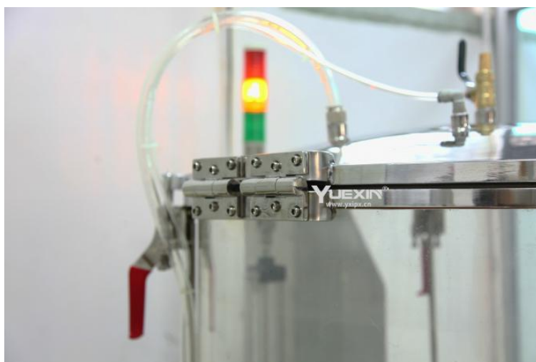
the edge of lid