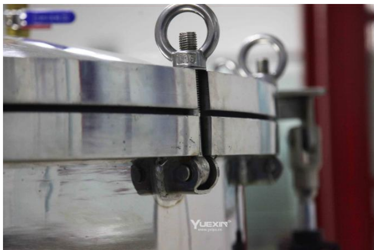
the edge of lid