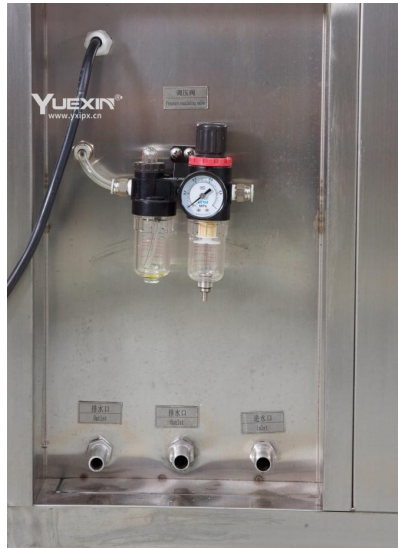
pressure regulating valve

Tags: Marine environment simulation test machine , Deep water environment simulation test machine , Water pressure environment test equipment