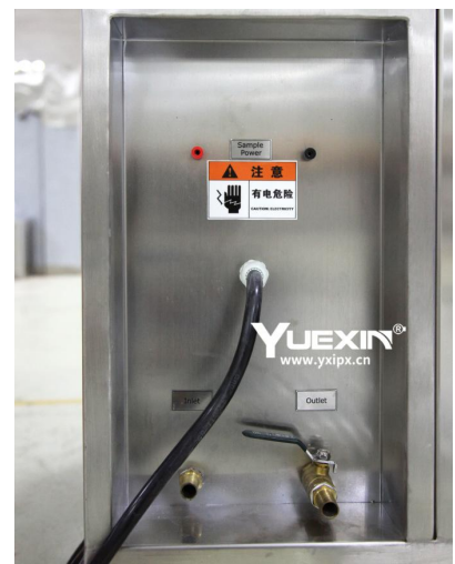
inlet and outlet

Tags: IPX9K Waterproof Test Machine , IPX9K Test Equipment , High Pressure Water Spray Test Equipment