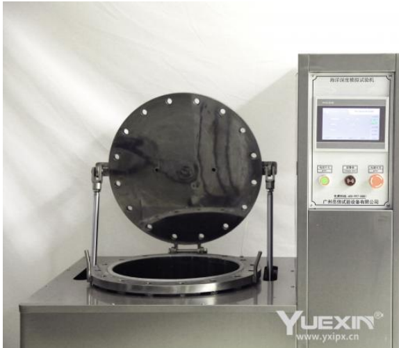
top of the jar