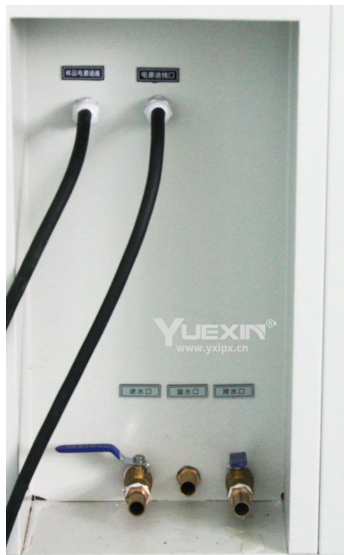
inlet and outlet

Tags: Water Jet Test Equipment, IPX5 IPX6 Rain Test Chamber, Water Jet Test Chamber